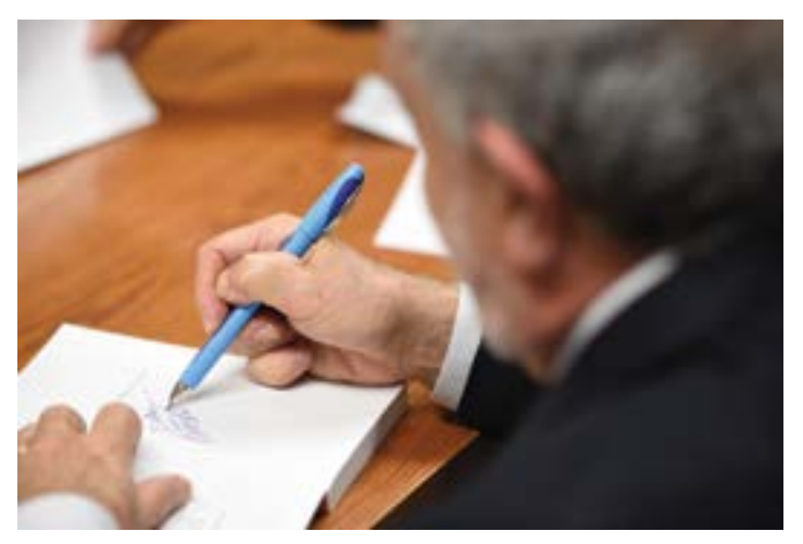
Reich signs books for students and community members.