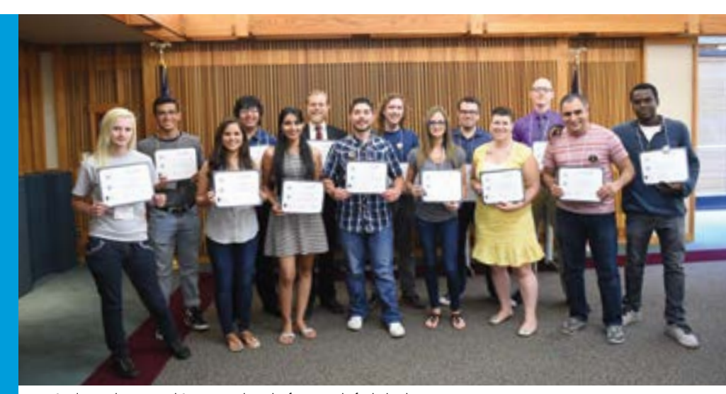
Students who received STEM awards in the first round of scholarships.