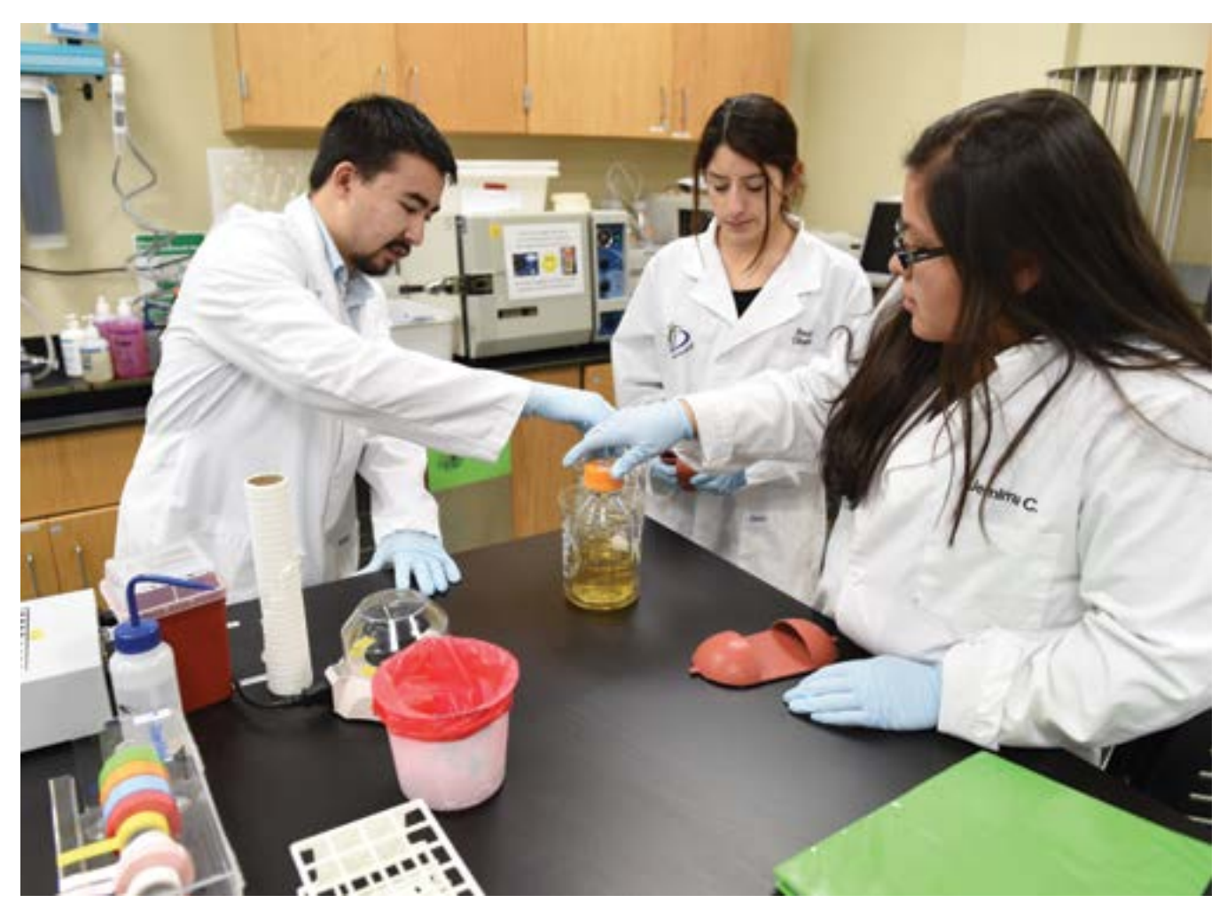
STUDENT facturED\ students\ manufacture\ biotechnology\ supplies\ to\ sell\ to\ college\ and\ local\ high\ school\ instructors.

the CBE curriculum to meet workforce needs, to fill 200-500 new jobs in Utah within the next five to 10 years.