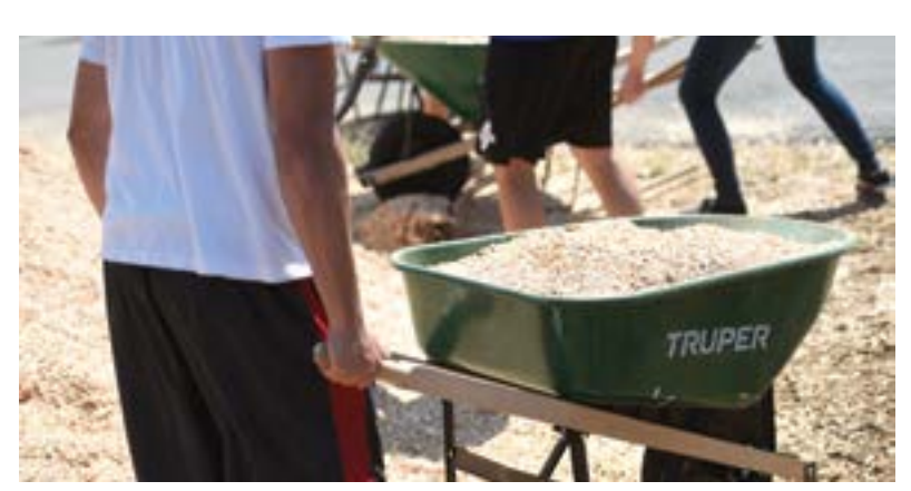
{\sf SLCC}\ students\ at\ a\ volunteer\ project\ at\ {\sf Camp}\ Kostopulos\ in\ Emigration\ {\sf Canyon}.