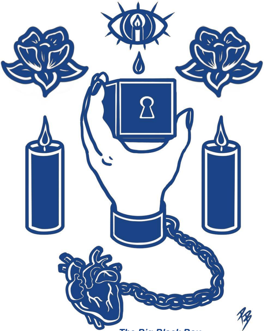
The Big Black Box