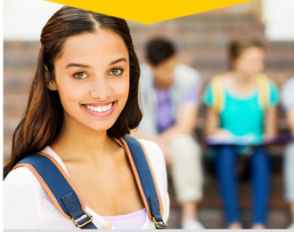
High School CE Students