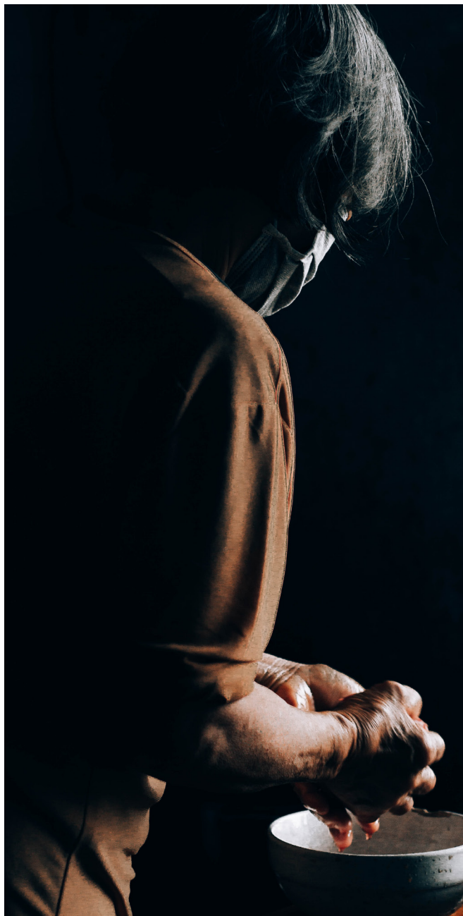
Woman in Brown Long Sleeve Shirt

We are excited to share our food and immigrant experiences with our wider community; to highlight what we have brought from our respective cultures and countries to our collective home.