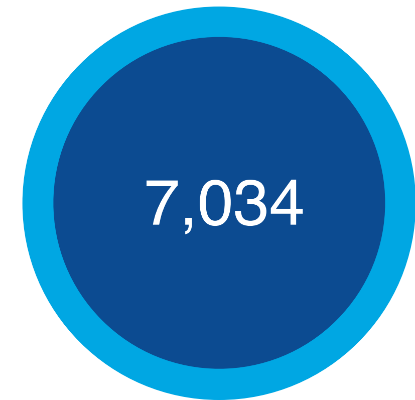
Require Developmental Education