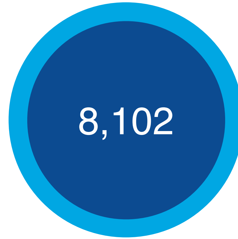
Received Pell Awards