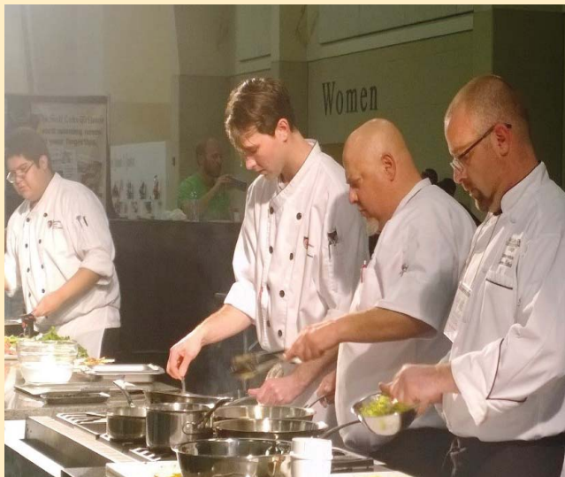
SLCC Culinary students prepare their dishes