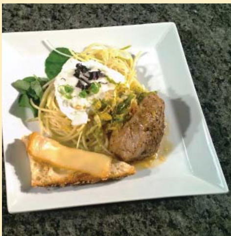
A Culinary Masterpiece