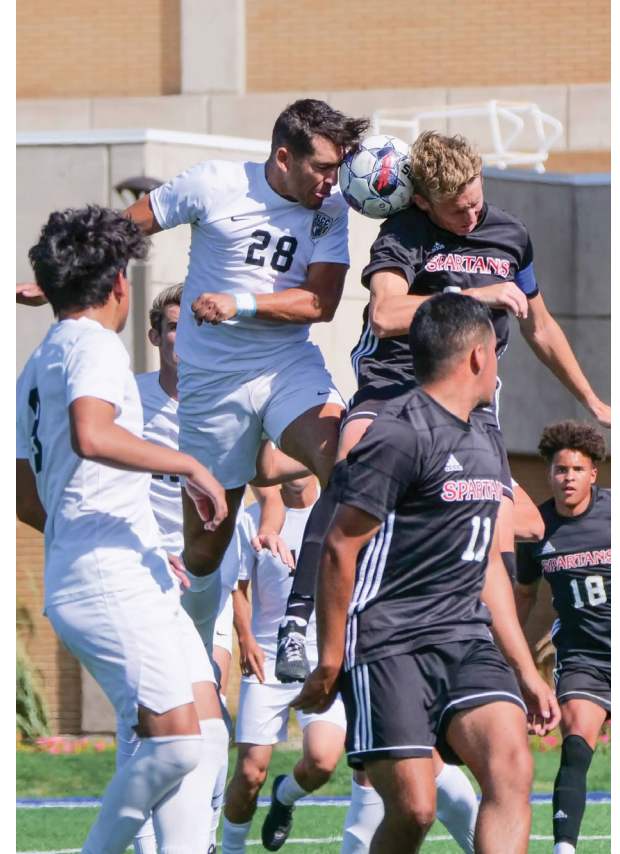
Top left, clockwise: Women's and Men's soccer matches, Women's volleyball team, Gary Payton II, and Women's Cross-Country team.