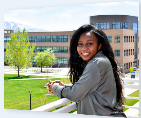
Taylorsville Redwood Campus

Check out our different locations! Visit slcc.edu and click on Maps to find directions, campus maps, and building diagrams. Campus Tours are available upon request at slcc.edu/admissions