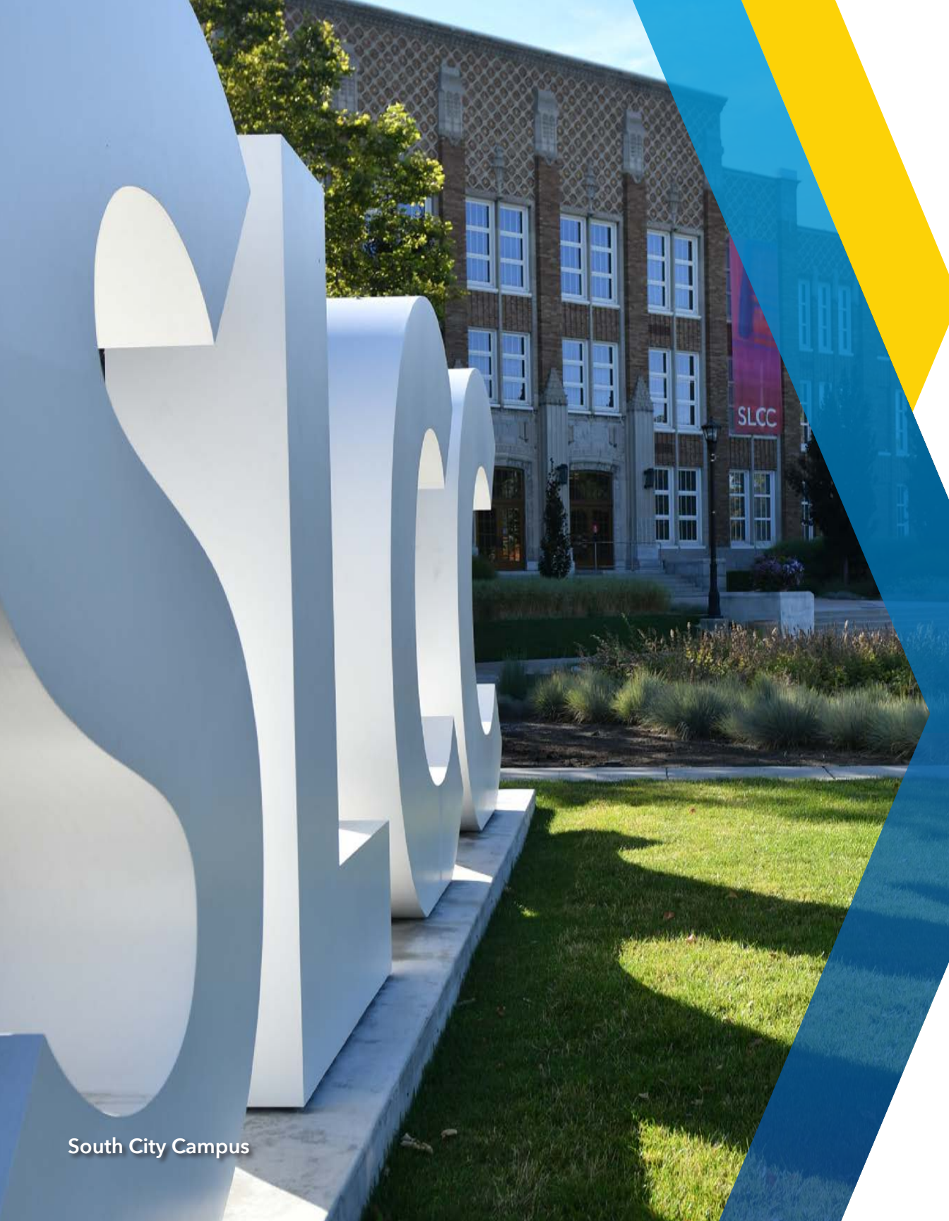
South City Campus