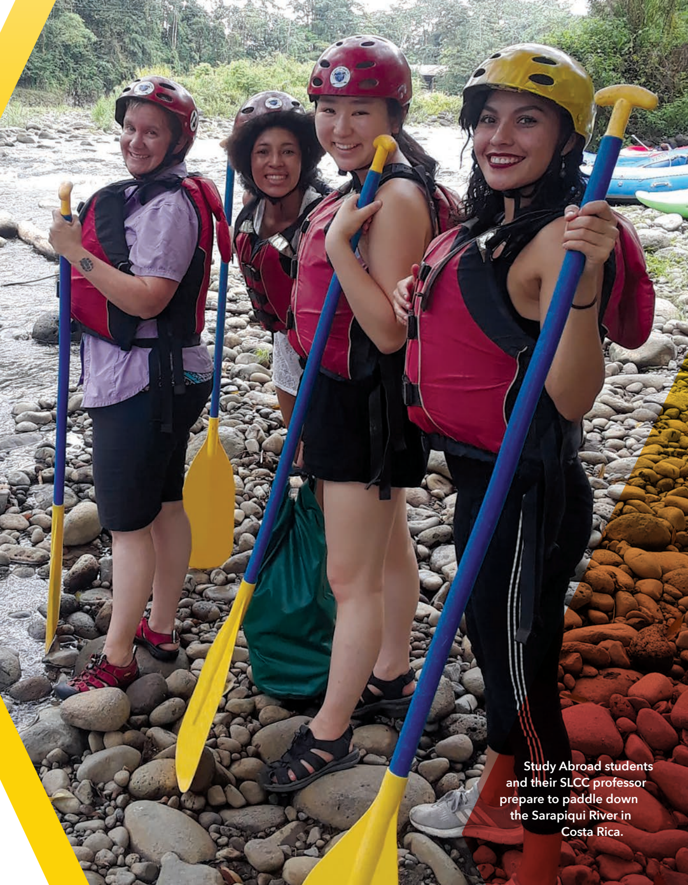
Study Abroad students and their SLCC professor prepare to paddle down the Sarapiquí River in Costa Rica.