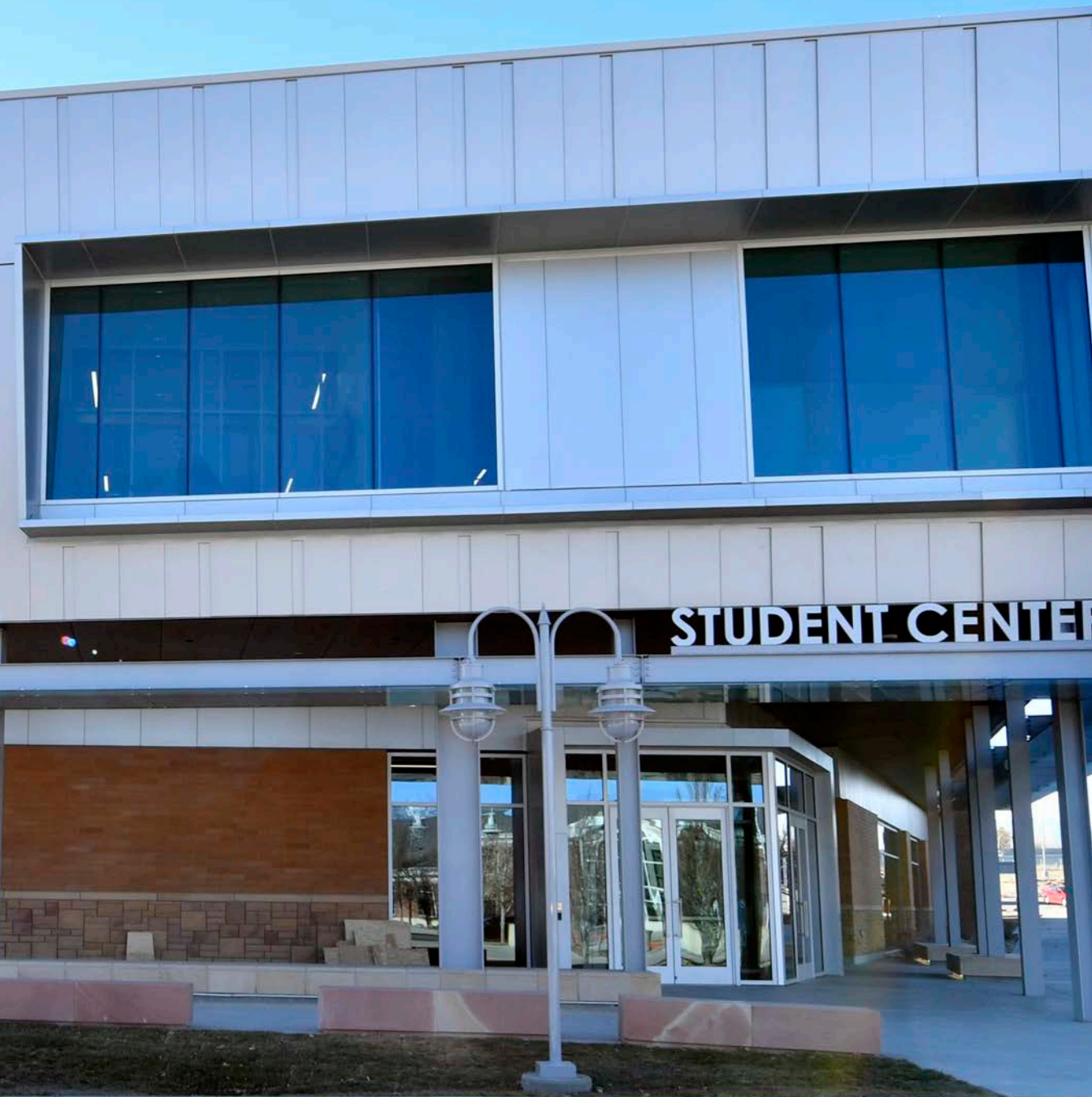
Tim and Brenda Huval Student Center at Jordan Campus